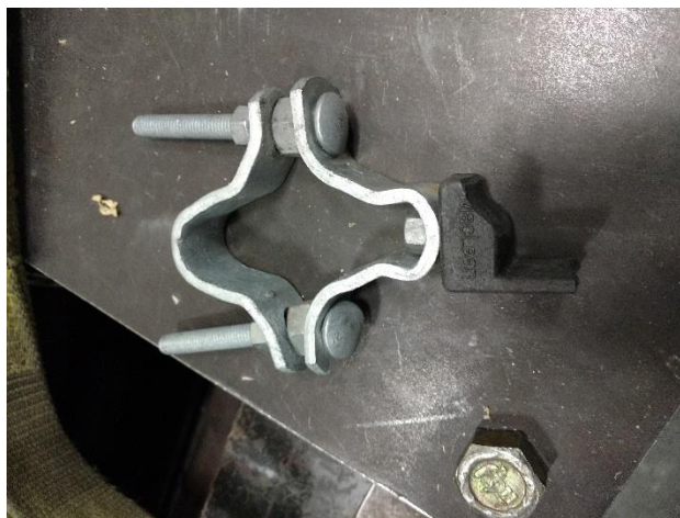
Samples after Tensile Test