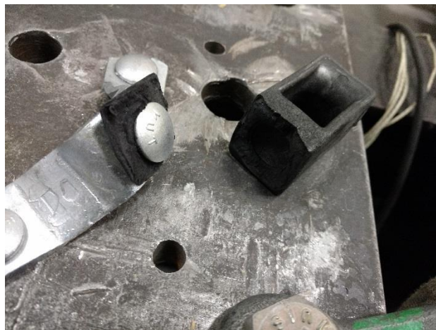
Sample after Cantilever Test