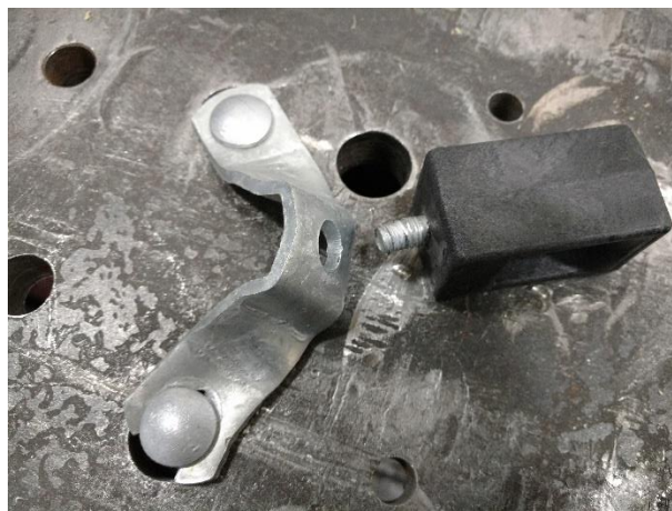
Sample after Cantilever Test