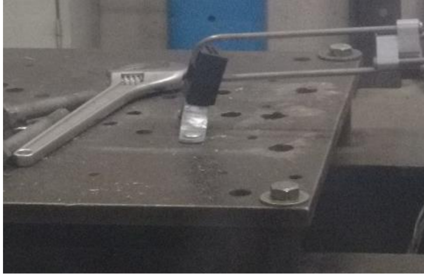
Figure 2: Cantilever Test Setup