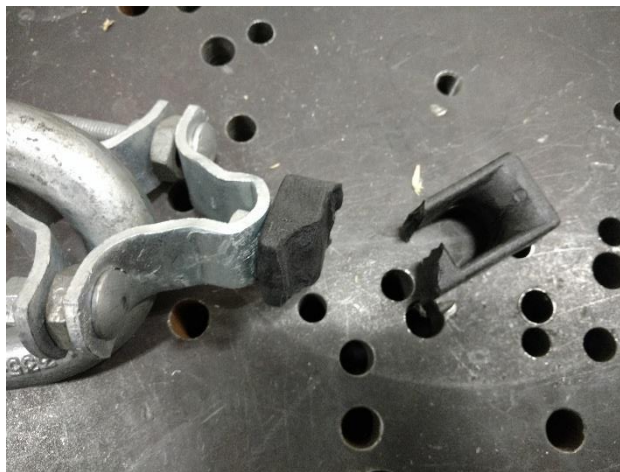
Samples after Tensile Test