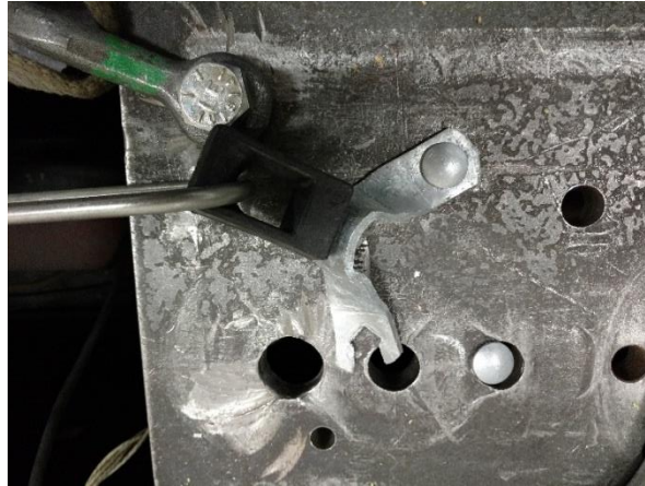
Sample after Cantilever Test