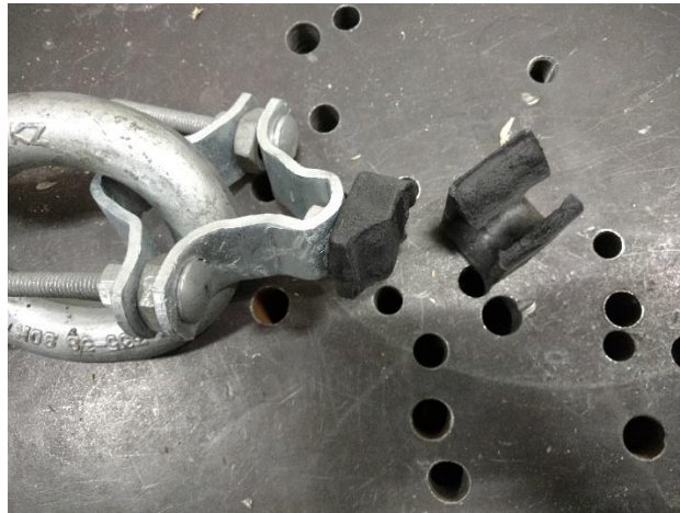
Sample after Tensile Test