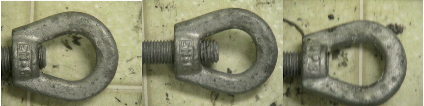
Figure 1: Correct Thread amount showing (1 to 3 threads nominal)