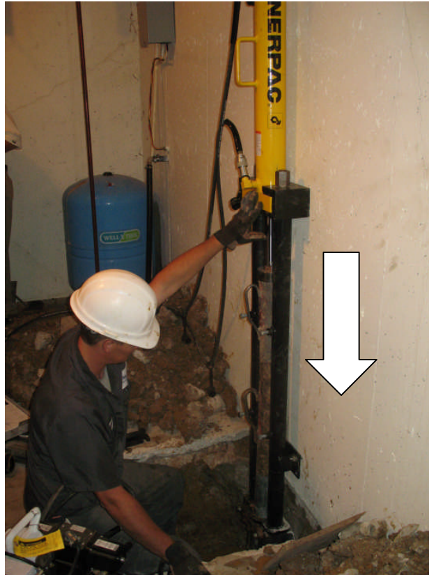
Pounds-force driving a resistance pile