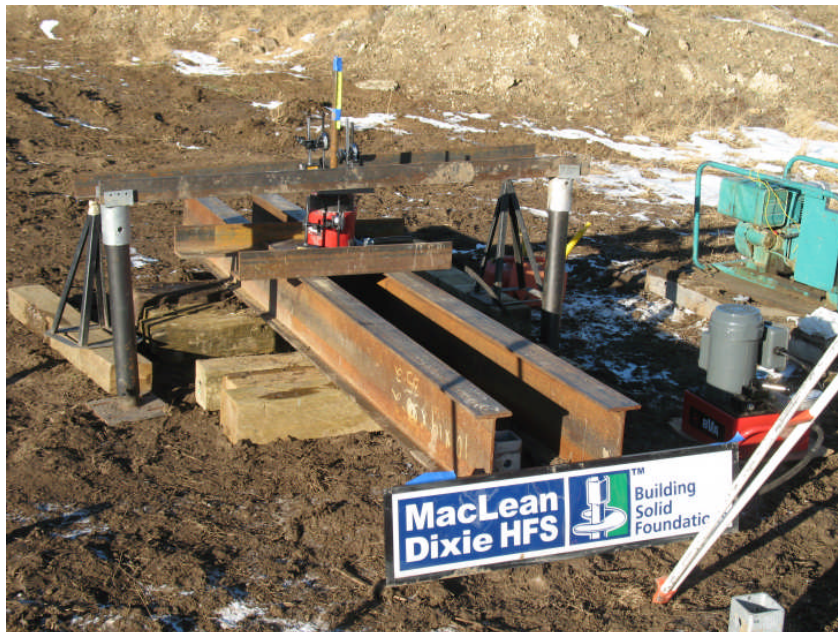
Pounds-force using a hydraulic cylinder to test pile in compression