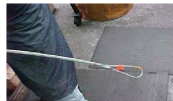
Top Deadend Pre-Assembled