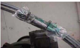
Bottom Deadend and Hardware Tie-Wrapped to Guy Kit

MPS can customize each guy kit to comply with local construction / material specifications, including assemblies that call for fiberglass guy strain insulators, guy grips, clevis-thimble or "johnny ball." All material is easy to handle and ready to install in one complete kit.